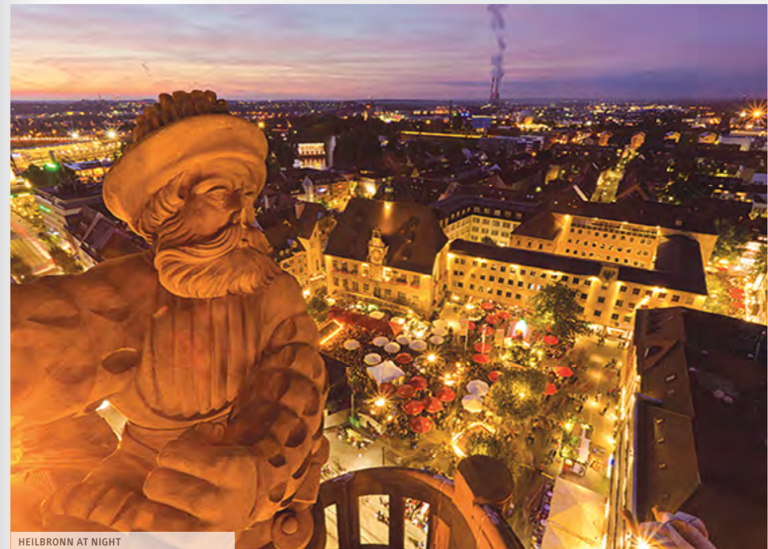
HEILBRONN AT NIGHT

Apart from the intensive academic coursework, a broad and diverse cultural program will be offered. International students will have the chance to discover one of Germany's most beautiful regions on day trips to nearby highlights, such as the automotive city of Stuttgart and the university city of Heidelberg.