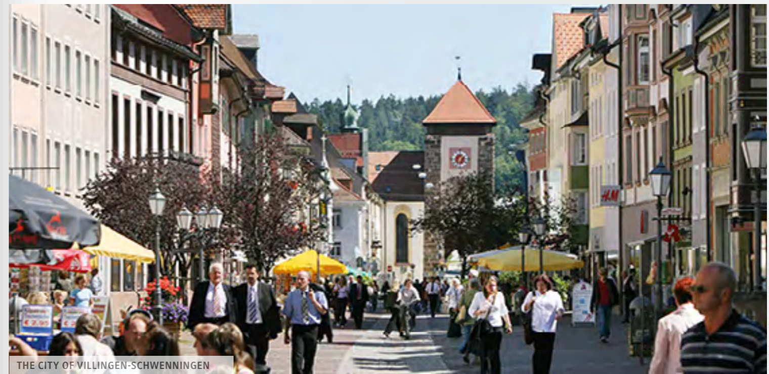
THE CITY OF VILLINGEN-SCHWENNINGEN

DHBW Villingen-Schwenningen offers a varied program of cultural and social activities, including visits to partner companies and memorable excursions to the beautiful Black Forest.