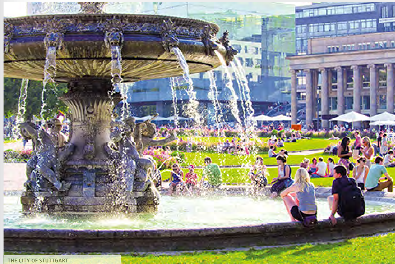
THE CITY OF STUTT GART

In summer DHBW Stuttgart becomes a meeting place for international students from partner universities: the Business Summer School offers a three-week program, encompassing lectures on business, culture, history, as well as various intercultural topics. Excursions to corporate partner companies and study trips are part of the intensive program.