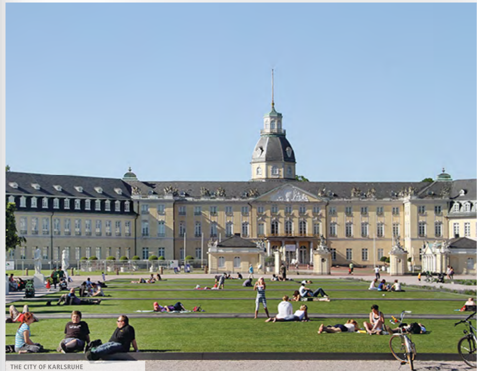
THE CITY OF KARLSRUHE

Intensive short-term study programs are regularly offered to exchange students from partner universities. The study period is two weeks. The programs cover subjects in the field of international business and related areas, enabling exchange students to study in an enjoyable and distinctly international atmosphere. Programs are rounded off by cultural activities and outdoor sessions. Students will have the chance to take part in guided tours of partner companies.