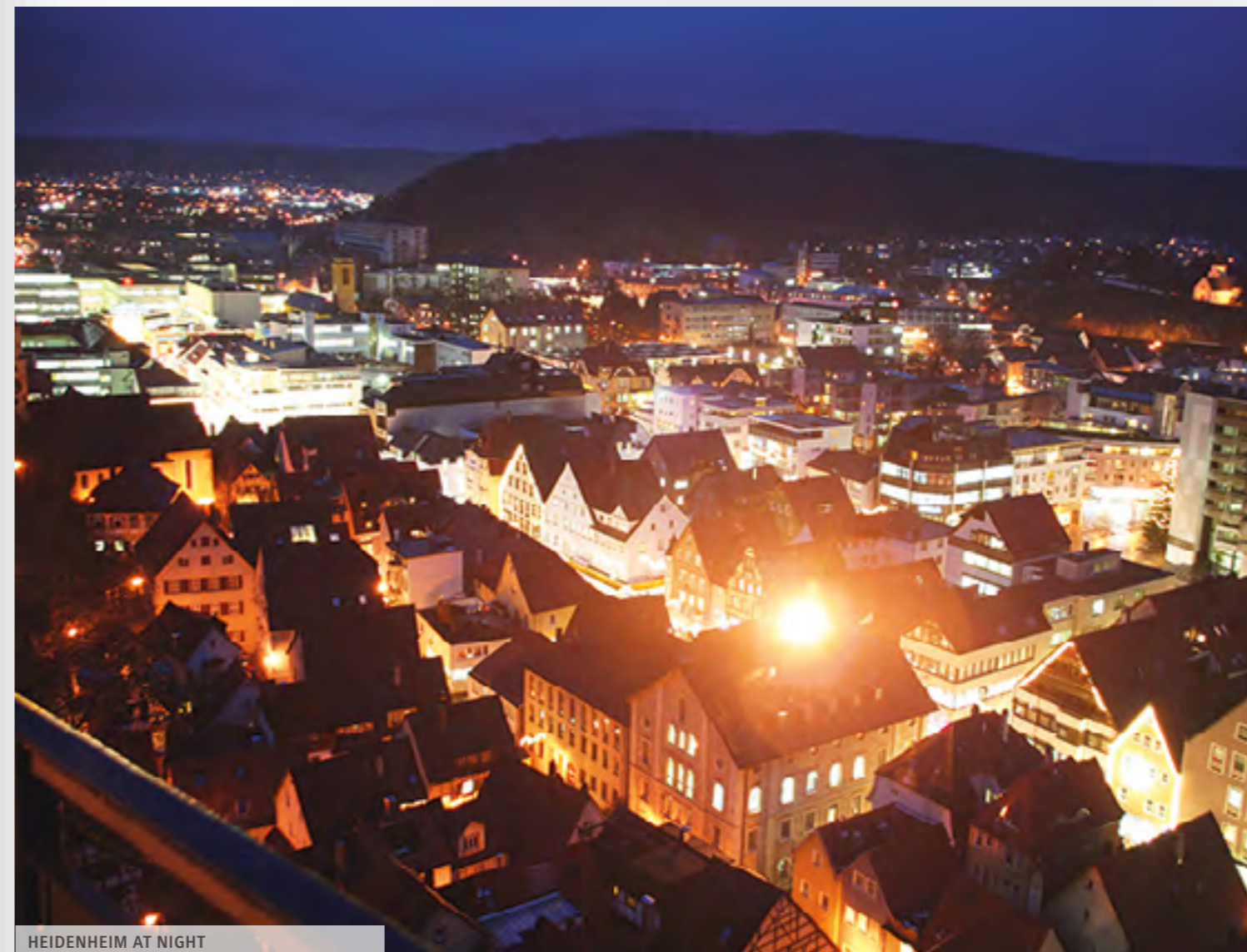
HEIDENHEIM AT NIGHT

In addition to the academic coursework, DHBW Heidenheim also offers a broad and diverse cultural program. Students will have the chance to see Berlin, Stuttgart, Munich and Heidelberg.