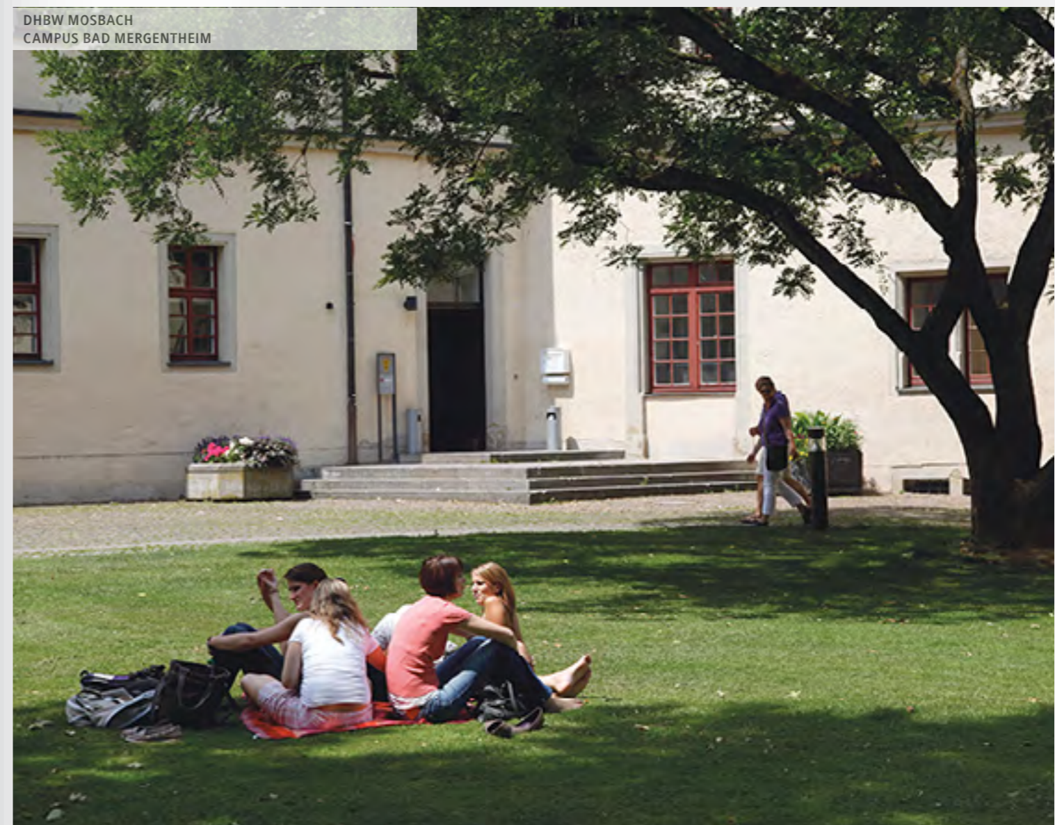
DHBW MOSBACH CAMPUS BAD MERGENTHEIM