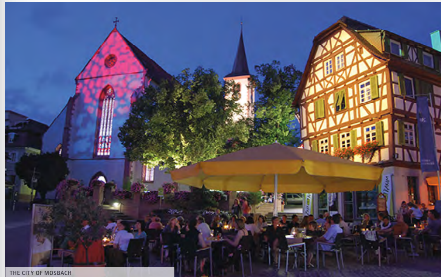
THE CITY OF MOSBACH

International students will be provided with an opportunity to learn about Germany, its language and its culture, as well as Germany's internationally oriented economy. Programs are rounded off by various outdoor sessions and cultural activities.