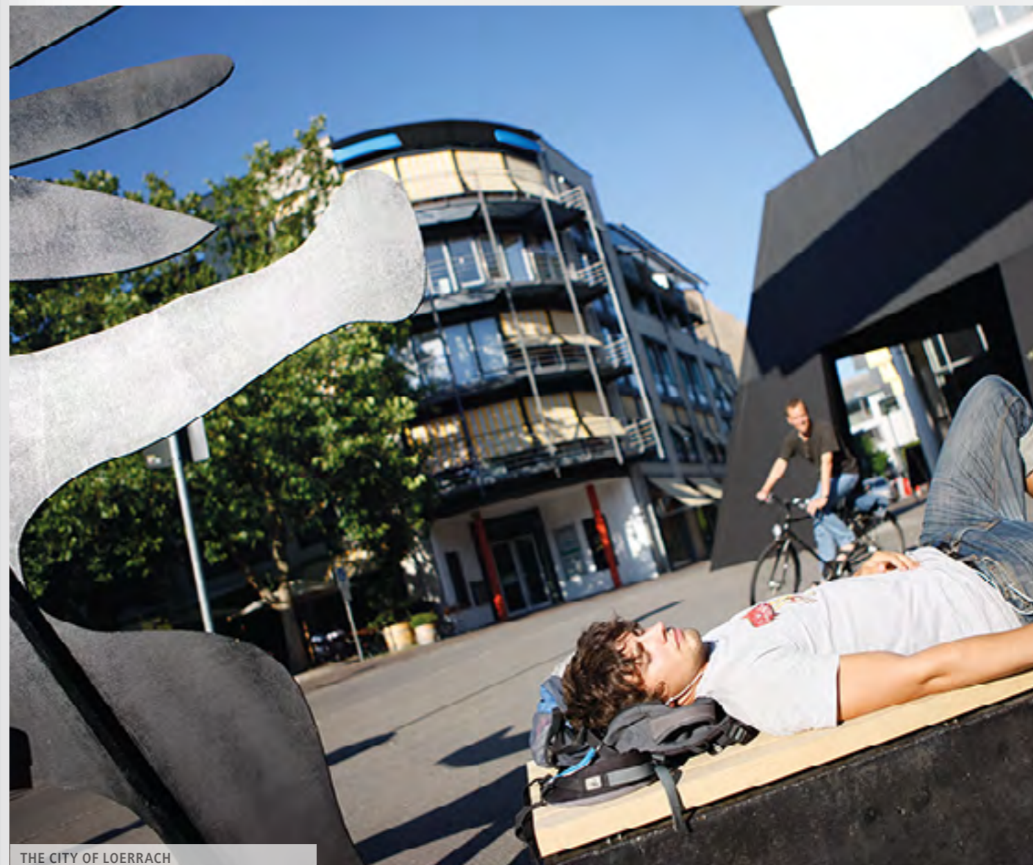
THE CITY OF LOERRACH

DHBW Loerrach encourages international exchange of students and staff and thus, offers a wide variety of language courses taught by native speakers. In addition, students have access to application assistance and international student orientation services, offered by the International Office.